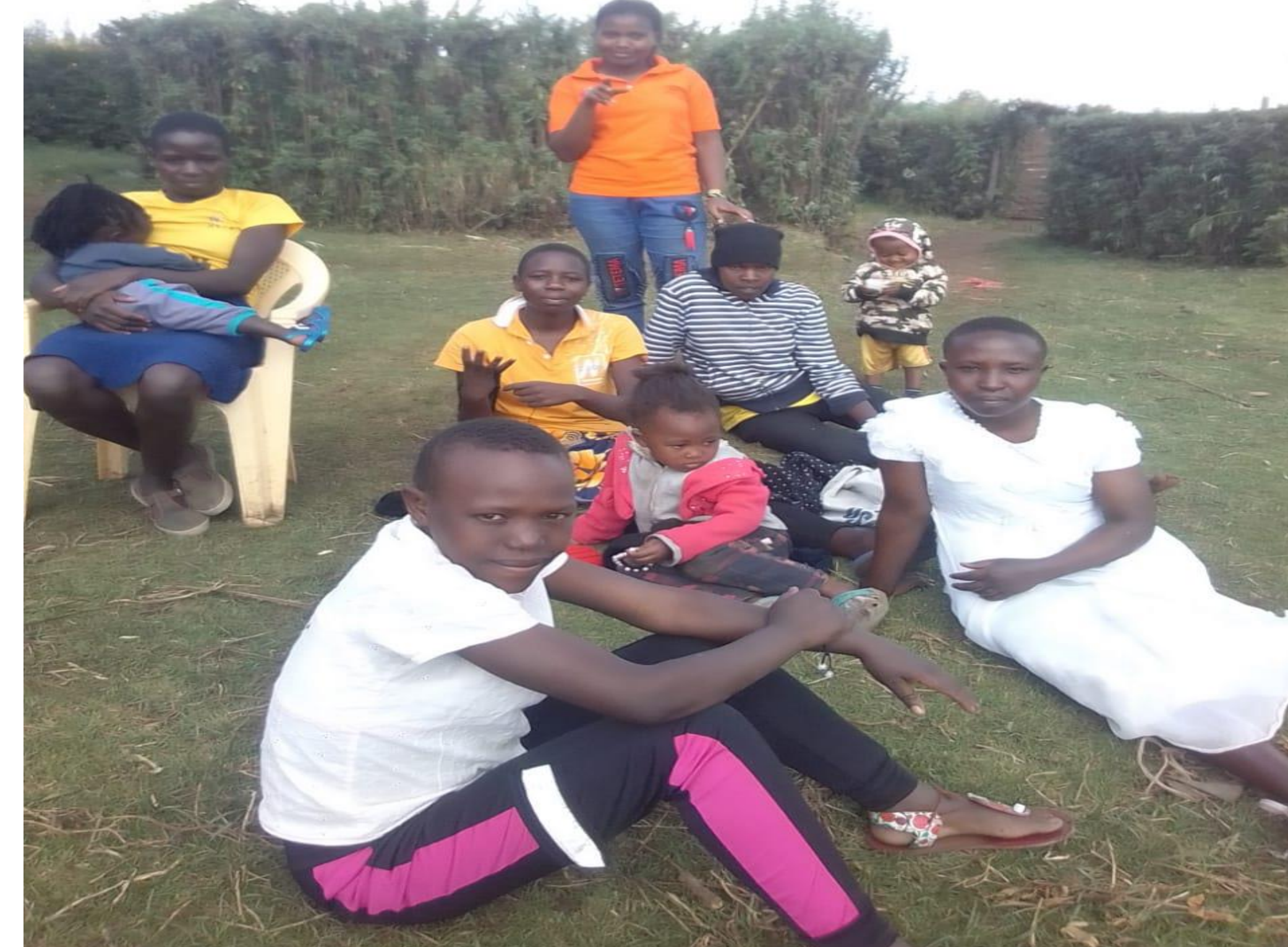
Binti Shujaa meeting in Elementaita ward

The design was a retrospective desk review of contraceptive and ANC uptake for females 10-19 years in Nakuru County; 2021. The project through S/CHMT implemented a peer-to-peer support strategy (Binti Shujaa). Young girls <24yrs with recent pregnancy experience with babies aged <24 months were recruited as champions and capacity built to create demand and referral for ASYRH services among their peers.