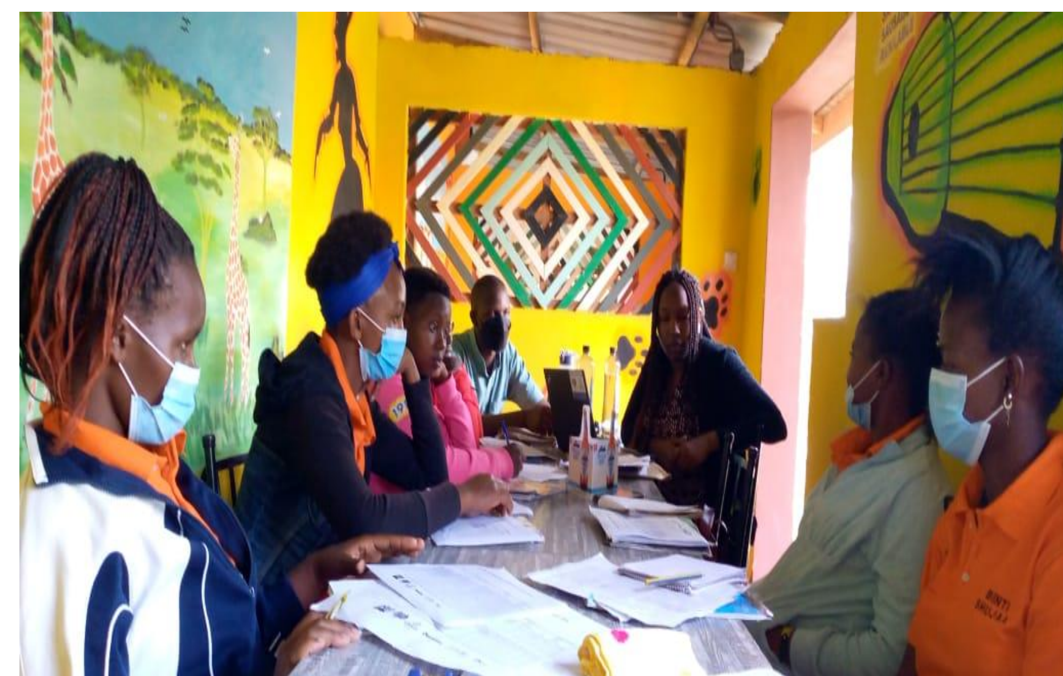
Binti shujaa data review meeting in Elementaita ward